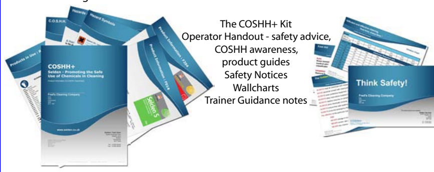
The COSHH+ Kit Operator Handout - safety advice, COSHH awareness, product guides Safety Notices Wallcharts Trainer Guidance notes

Via the iNsiGht system, the user can define single or multiple sites (cleaning locations). Products that are used on these sites are assigned via a simple selection tool. Once all required products are specified a single click of the mouse creates a full training kit; handouts for the operators, safety notices, wallcharts etc. All of which are specific to the site. The training kit focuses on the hazards, risks and procedures relating to the products in use. Of course, information regarding the full spectrum of hazards and risks is provided, but emphasis is placed on the safe use of the chemicals the operative will be using.